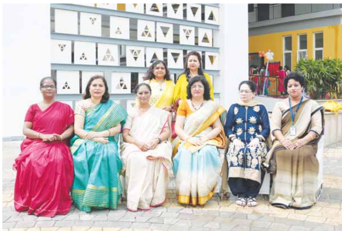
Sitting Left to Right:

Day Care Centre The objective of the day care centre is to support working parents. The crèche has the capacity to take in 25 children. This facility is run on a policy of no profit and no loss. It operates from 8:30 am till 6 pm. At present it has 20 children.