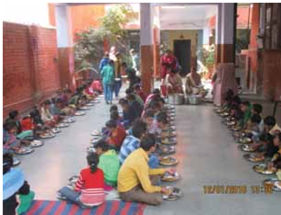
Mid – Day Meal