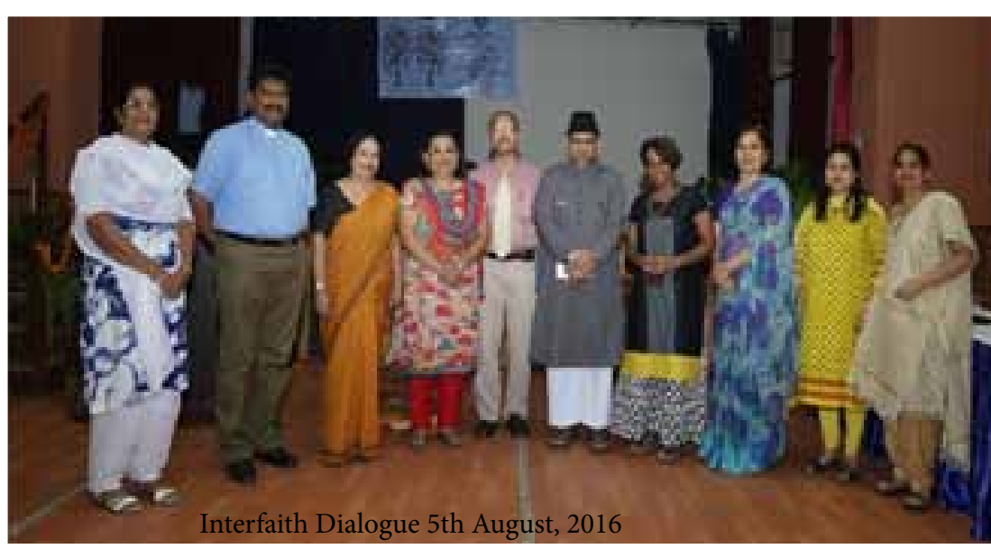
Interfaith Dialogue 5th August, 2016