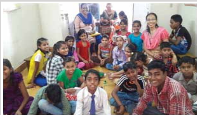
Rdp Summer Camp