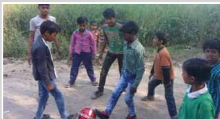
Rag Pickers Center

diseases, Anemia with prominent and proficient speakers from respective fields to empower the listeners on these social issues.