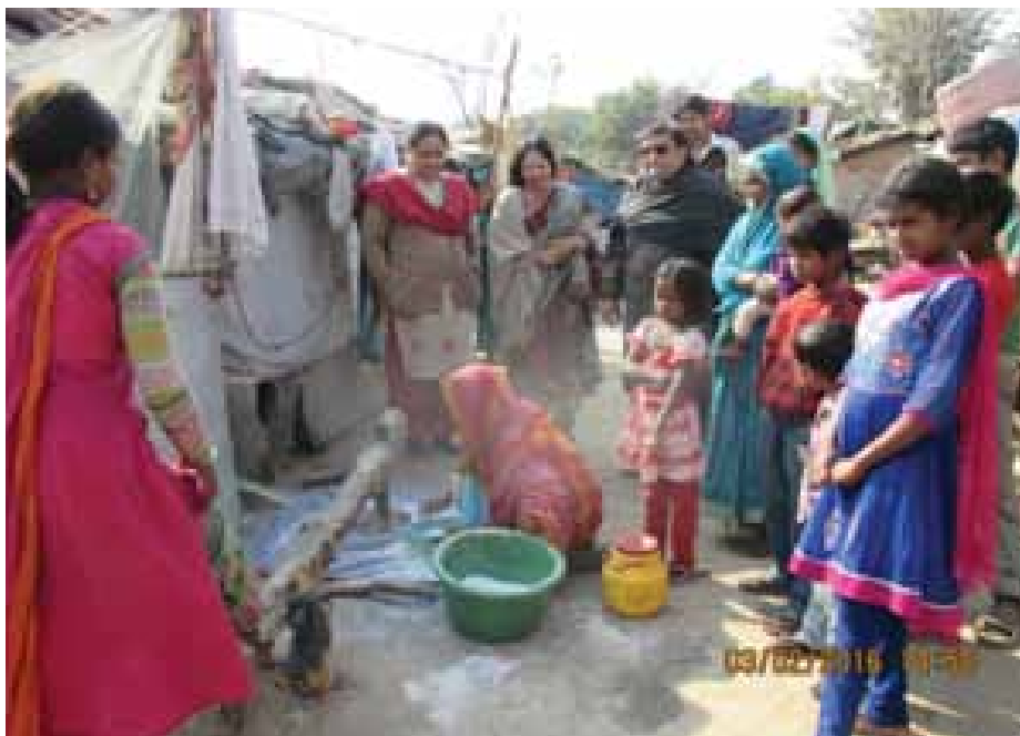
Rag Pickers Center