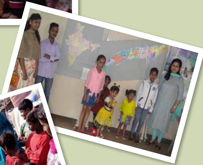
Counselling at MatritvaChayya by Members