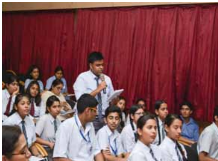
Inter School Debate on 15th July, 2016