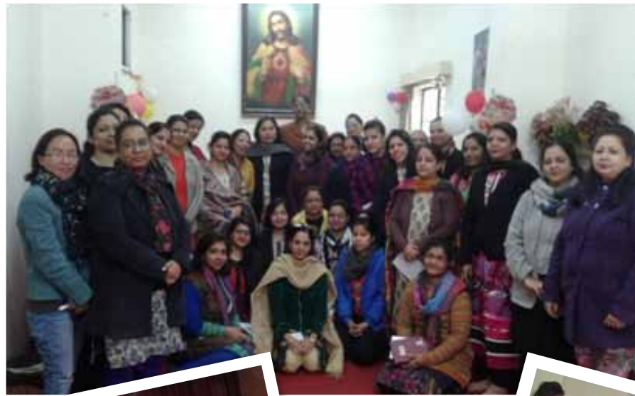
World Day of Prayer on 4th March 2016