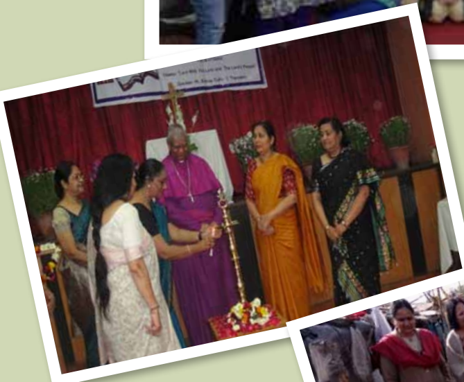
Lenten Retreat on 11 March, 2016