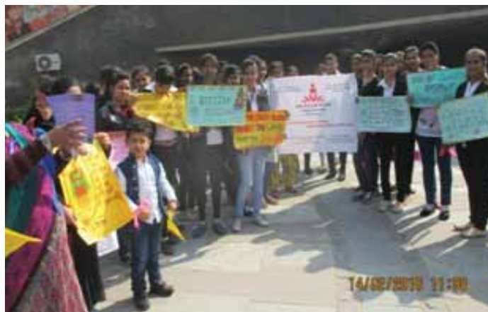
One Billion Rising (OBR)