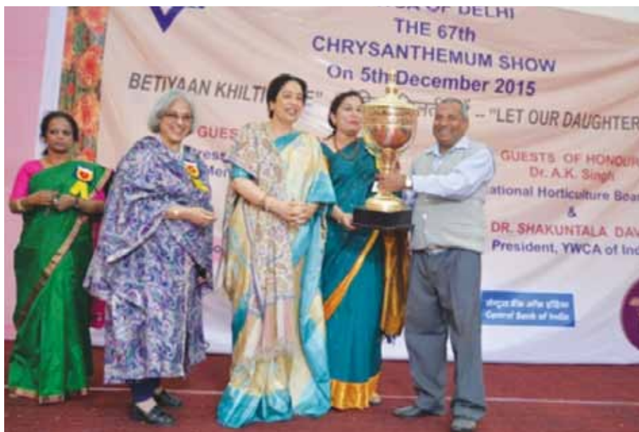
67th Chrysanthemum Show on the 4th & 5th of December 2015- Betiyaan Khilti Rahe- बेटियाँ खिलती रहें -- “Let Our Daughters Bloom”