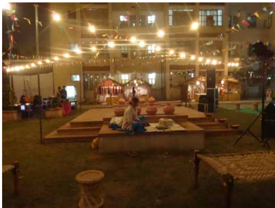
Christmas celebrations 2015 Village theme

The Ministry of Women and Child Development jointly with Ministry of Development of North Eastern Region, Government of India has set up the Working Women's Hostel, Jasola Vihar, New Delhi for women of the North eastern States and other women in search of a home in Delhi, in order to provide safe, comfortable and affordable accommodation. With 167 triple sharing rooms with bed capacity of 501, it has a Dining Hall with Mess facilities to meet the diverse taste of the residents, T.V. Lounge on every floor, Visitor rooms, Guest Rooms, adequate parking space, Generator Back-up and Lift facilities. Rooms upto the 5 th floor are being occupied presently. The Management of the Hostel was entrusted to the YWCA of Delhi in August 2011.